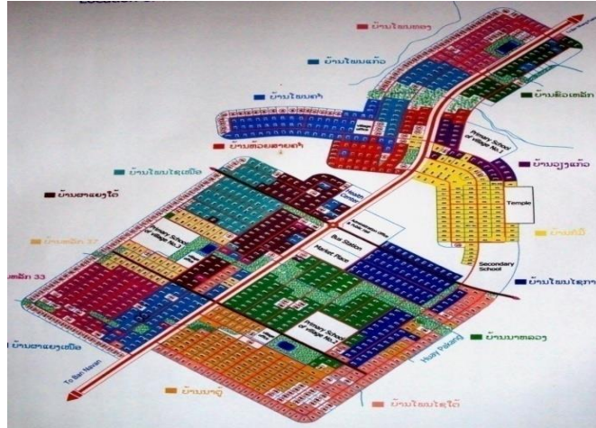
Figure 3. Map of Phonsavath Resettlement Town in Fuang District.